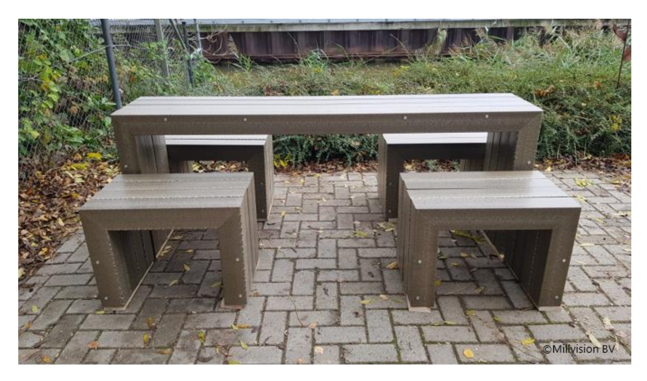
Figure 1: Developed prototype picnic set by Millvision