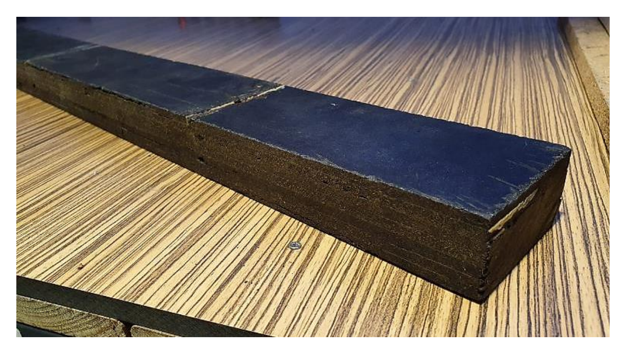
Figure 21: Developed prototype of a jetty board plank by Avans

The sole responsibility for the content of this deliverable lies with the authors. It does not necessarily reflect the opinion of the European Union. Neither the EACI nor the European Commission are responsible for any use that may be made of the information contained therein.