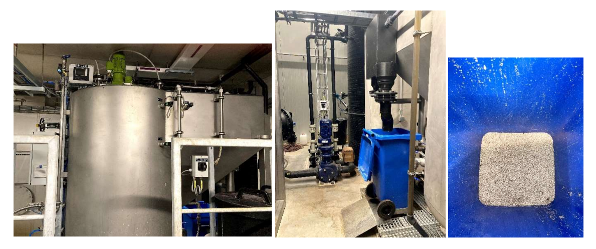
Figure 2. From left to right 2a: struvite reactor, 2b: harvesting system with container, and 2c: struvite produced

In Figure 2a , the struvite reactor is depicted. MgCl2 and NaOH are dosed to create preferential conditions for struvite production. The struvite is then separated via a sieve. This system functions well and an almost waterless struvite is harvested from the reactor (see Figure 2b and 2c ). By harvesting the struvite, a container is filled. When full, the struvite can be used as a product (see Potential end-users)