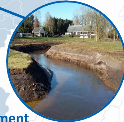
Catchment Kleine Aa/ Molenbeek