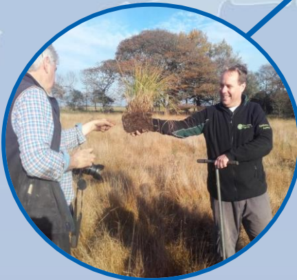
North Devon catchment