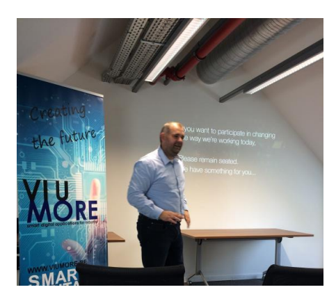
Taster Session Viumore, East Flanders, 2016