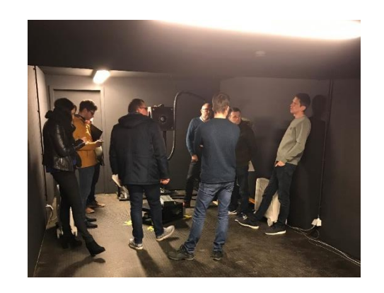
Innovation in Lighting - Follow-Up/Practical Session, Kortrijk: