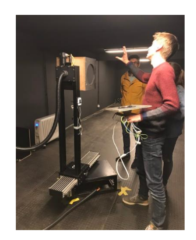
Innovation in Lighting - Follow-Up/Practical Session, Kortrijk: