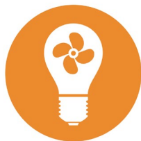
Framework conditions for innovation

The Programme would like to congratulate these projects and wish them good luck with their implementation!